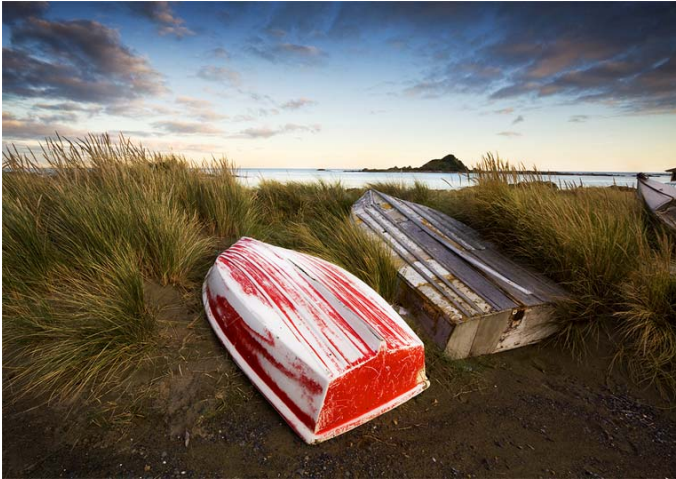
Untitled image by Dave Arthur

Fiennale is the graduation exhibition of WelTec's Bachelor of Visual Arts students. This show explores cultural, social and historical themes through contemporary visual art wall and floor installations, audio-visual and photography. The pieces by these emerging artists reveal a pastiche of styles as diverse as the makers of the works.