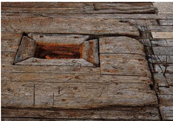
Old boat hatch cover by Mike Drain

Congratulations to all the above members.