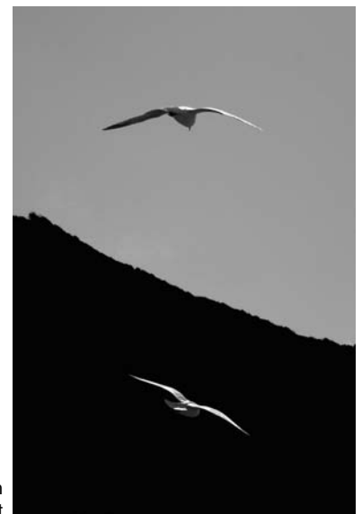
Two birds, Makara beach

The AGM is rapidly approaching and we will be calling for nominations for committee members soon. More than half the current committee will not be standing again and we currently do not have enough people who have indicated that they would be willing to stand to cover all positions, including for President. Please give some thought to whether you can help the society in one of the committee positions. If you would like more information, please approach one of the existing committee members.