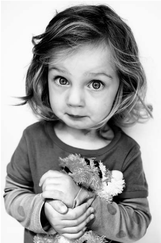
Eva and Tiggy by Catherine Cattnach

We need as many members as possible to go along and cheer loudly for our entries and heckle the judge when he/she doesn't see that our print is the best.