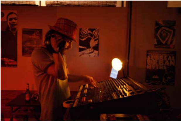
Image by Matthew Wanden (entry in 2007 WPS Projected Image Competition)

Flowers and Foliage showcases two portfolios of photographs, each containing images of controlled and restrained nature. One is by the celebrated and often controversial American photographer Robert Mapplethorpe, the other by Wellington photographer Peter Black.