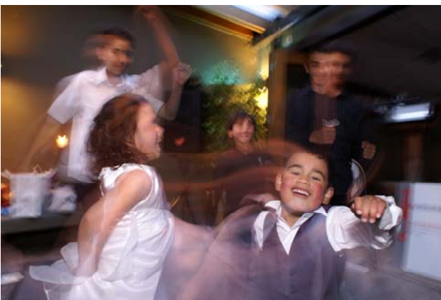
'Kids dancing frenzy' by Jane Tweedy (entry in 2007 WPS Projected Image Competition)

WPS members must submit their prints and digital projected images for consideration for selection in the WPS Central Regional Interclub sets at the 11 September meeting. Details of how to submit digital images will be advised later to all members. Any member unable to attend the meeting on 11 September may leave their prints at Wellington Photographic Supplies, 11-15 Vivian St. Wellington up to 5pm on 11 September.