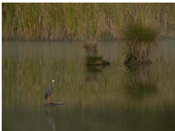
'On watch' by John Boyd (entry in 2007 WPS Projected Image Competition)